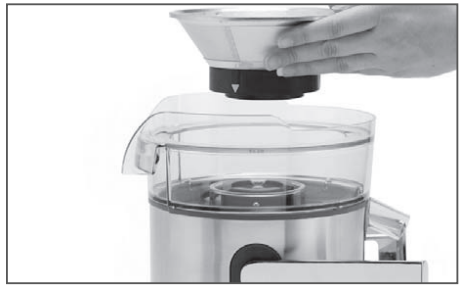
Step 4 Place the juicer cover over the filter bowl surround, positioning the feed chute over the juice disc and lower into position.

Align the arrows at the base of the juice disc with the arrows on the motor drive coupling and push down until it clicks into place. Ensure the juice disc is fitted securely inside the filter bowl surround and onto the motor base.